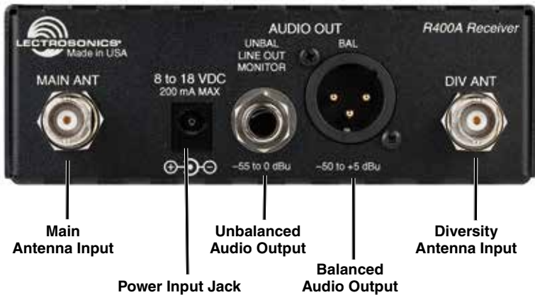
Main Antenna Input