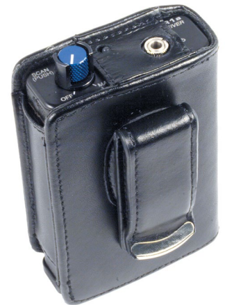
The R1a comes with a protective leather pouch with an integrated belt clip.

The incoming RF signal is filtered and amplified, then mixed down to the IF frequency with a microprocessor controlled synthesizer. A pilot tone squelch system is used to keep the receiver silent when no carrier is present. The pilot tone signal is on a different frequency than Lectrosonics UHF wireless microphone systems to prevent interference when the systems are used in the same location. The audio signal processing includes compressor noise reduction for low noise and excellent intelligibility.