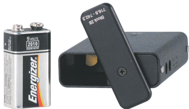
An attached rotating door makes battery installation easy.

The receiver is housed in a compact machined aluminum enclosure. The unit features an integral rotating battery door that remains attached to the housing when opened. All nomenclature is laser engraved into the housing to withstand physical abrasion and heavy use. A condensed instruction set is also laser etched into the side panel of the receiver.