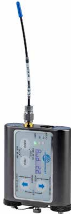
Digital Hybrid Wireless® U.S. Patent 7,225,135