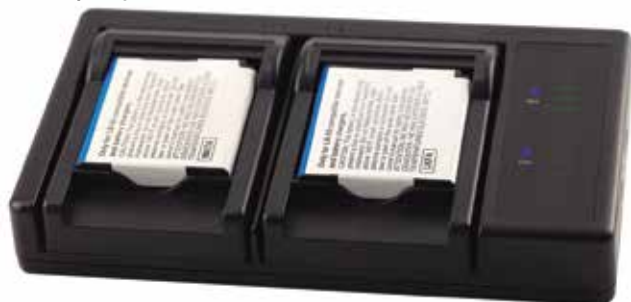
Battery charger kit P/N 40117

CAUTION: Use only Lectrosonics battery chargers; P/N 40117 (as shown) or CHSIFBRIB.