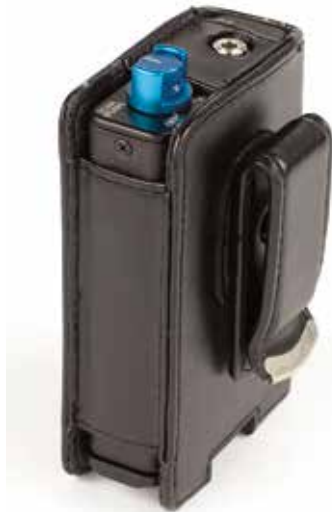
The R1a includes a leather pouch with a rotating belt clip

The frequency agile IFB R1a FM Receiver is designed to operate with the Lectrosonics IFB transmitters and compatible Digital Hybrid transmitters. Microprocessor control of frequencies within each frequency block provides the ability to work around interference problems quickly and simply.