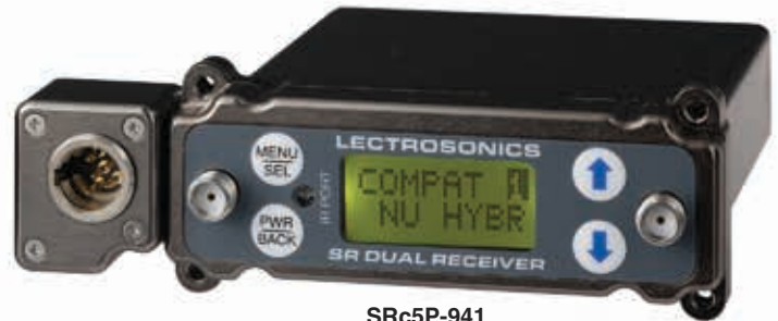
SRc5P-941 (5 pin secondary audio input)