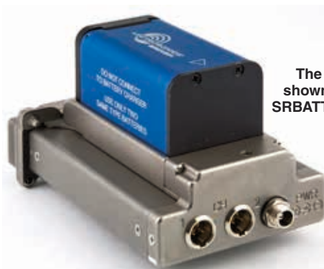
The SR9VP adapter shown mounted on the SRBATTLEDTOP adapter