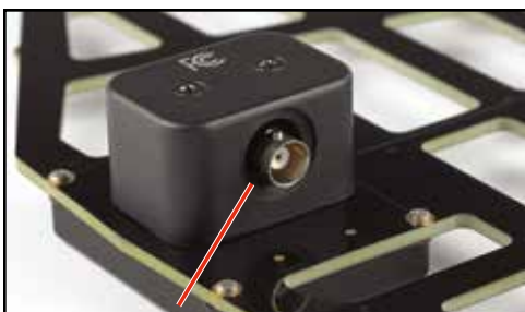
Power is provided by DC bias on the output connector

The antenna is powered by DC bias inserted on the coaxial cable connected to the 50 ohm BNC jack. This power can be supplied by a Venue Series receiver, an active multicoupler or an inline BIAS-T. When no power is applied, the antenna automatically switches to passive operation. When used in active mode, RF filtering can be selected between 470-608 MHz or 470-700 MHz for operation in different regions.