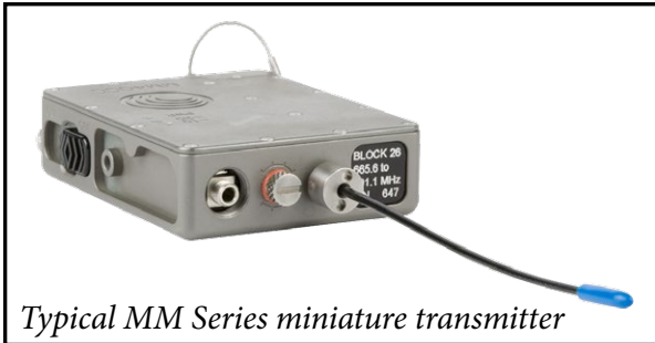
Typical MM Series miniature transmitter