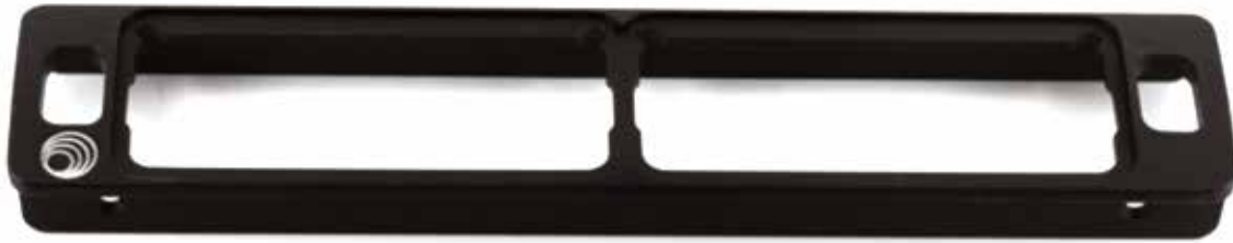
Front Panel (P/N 27379 or 27375)