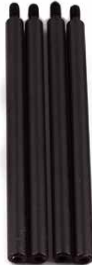
Extension Rods (P/N 27384, 27386 or 27387)