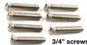
3/4" screws (P/N 28942)