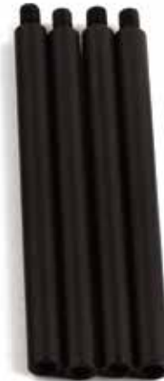
Support Rods (P/N 27385)