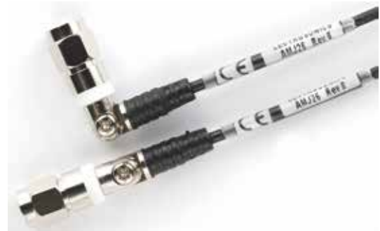
The hinged joint pivots in both directions

NOTE: Disconnect antennas from equipment for storage and transport. 25 lbs. of lateral force near the hinge pin can break the center pin.