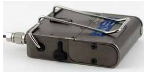
A USB port on the side panel is used for firmware updates.

Digital Hybrid Wireless® is a patented design that combines 24-bit digital audio with an analog FM radio link to provide outstanding audio quality and the extended operating range of the finest analog wireless systems. The design overcomes channel noise in a dramatically different way, digitally encoding the audio in the transmitter and decoding it in the receiver, yet still sending the encoded information via an analog FM wireless link. This proprietary algorithm is not a digital implementation of an analog compander. Instead, it is a technique which can be accomplished only in the digital domain, even though the audio inputs and outputs are analog signals. *US Patent 7,225,135