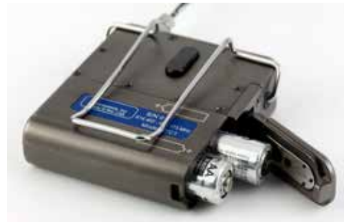
A mached aluminum, hinged door maintains reliable battery contact.