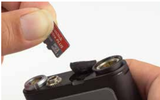
The audio is recorded on a microSDHC memory card.

When the distance is extreme or using a wireless microphone is not practical, the PDR recorder can travel with your subject and capture professional quality audio, synchronized with timecode. It's tiny size is unobtrusive and easily placed in garments and costumes, and easy to conceal when used as a “plant” microphone to capture environmental or location sound.