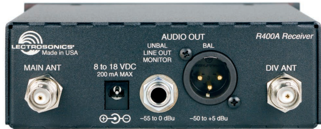
The rear panel of the receiver includes a locking power supply input jack, balanced and unbalanced outputs and two standard 50 ohm BNC antenna jacks.

Also featured are a locking power input jack that can accept 8-18 VDC (center pin positive). The power input is diode protected against reverse polarity.