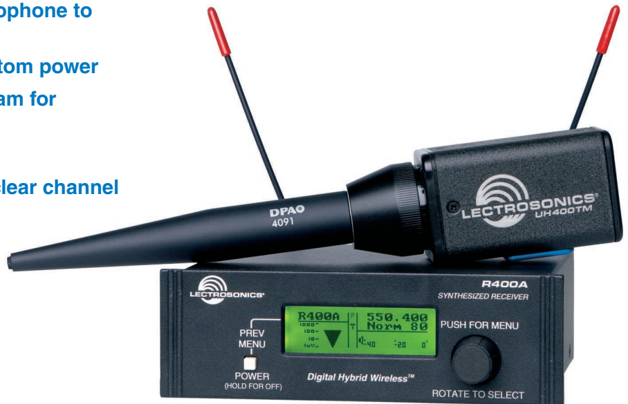
*Microphone not included with system.

Digital Hybrid Wireless™ (US Patent 7,225,135)