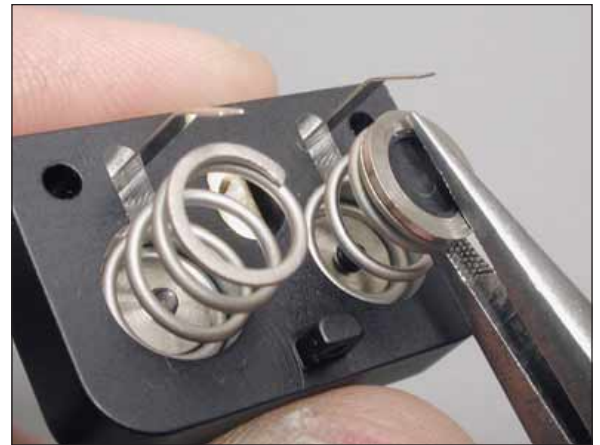
Figure 4 - Installing the polarity protector