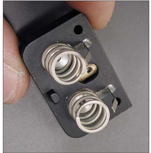
Figure 3 - The endcap assembly