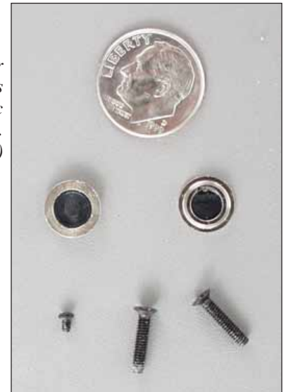
Figure 1 - Kit number BP210AABATTKIT consists of two metal and plastic inserts and three screws. (Dime not included.)