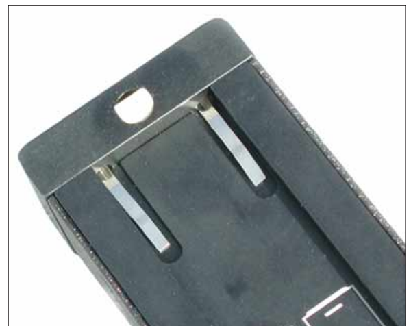
Figure 5 - The contact tines must be visible after re-assembly.