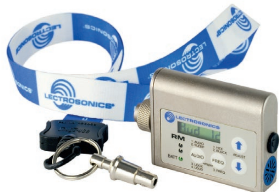
The RM is supplied with a quick-release lanyard.

The RM is packaged in a machined aluminum housing with a rugged corrosion-resistant finish like the SM Series transmitters. A membrane switch panel helps protect the LCD and internal circuits from moisture and dust.