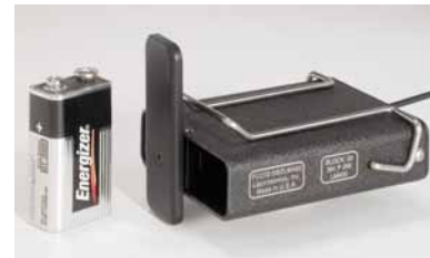
The machined aluminum battery door is hinged to the housing. Battery contacts automatically adjust to a wide variety of alkaline and lithium 9 V batteries.

The LM transmitter is constructed of machined aluminum to provide the ruggedness needed in the field. The extruded housing is finished with electrostatic powder coat, and the control panel and battery door are finished with anodized surfaces. Nomenclature is laser etched into the finishes for lasting legibility.