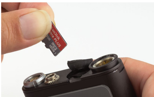
The audio is recorded on a microSDHC memory card.